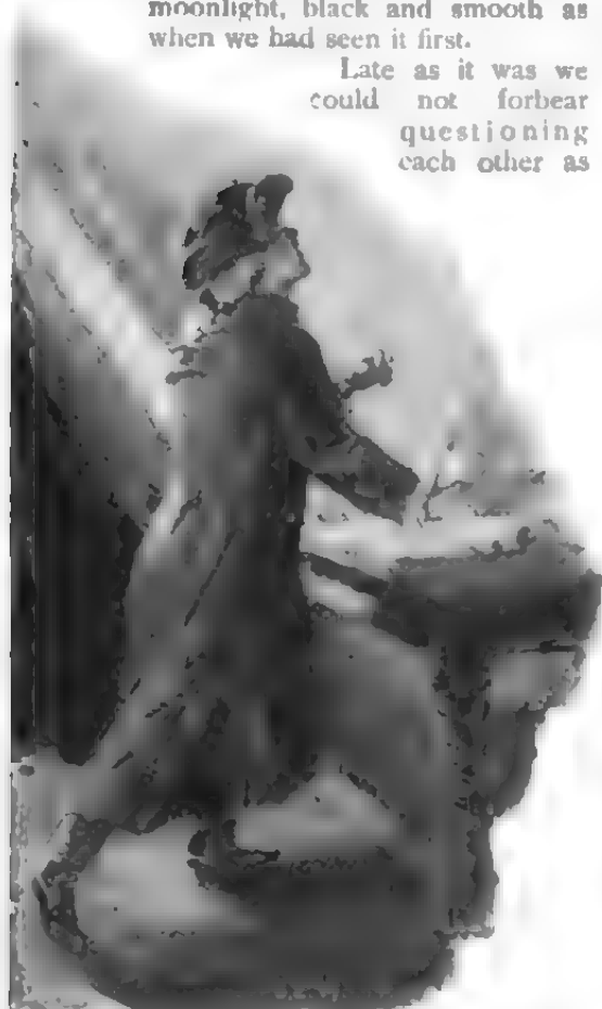
He was in the act of stretching out his fingers to pick up the rose . . . when Sir William fired.

Late as it was we could not forbear questioning each other as